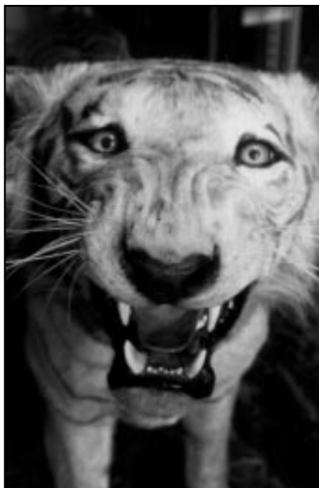
Bengal tiger in the museum's collection

The Blaschkas turned the then modern passion for natural history and collecting to use. But Leopold Blaschka recognized the importance of tradition in what he did: "The only way