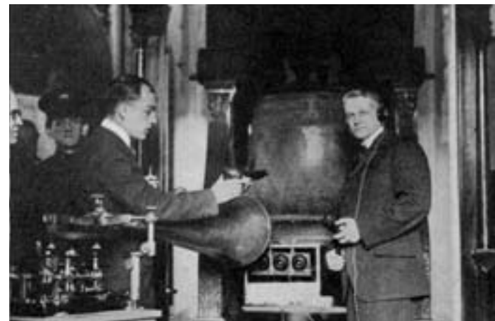
PREPARING TO SEND THE TONES OF THE LIBERTY BELL FROM PHILADELPHIA TO SAN FRANCISCO VIA THE TRANSCONTINENTAL TELEPHONE LINE

Henry Lee Higginson was a noted Bostonian banker and philanthropist. As a young man during the Civil War, he and his seven friends joined the army, where he served with distinction and attained the rank of major. Six of the seven friends were killed in the war, a terrible personal loss that would profoundly shape the rest of his life.