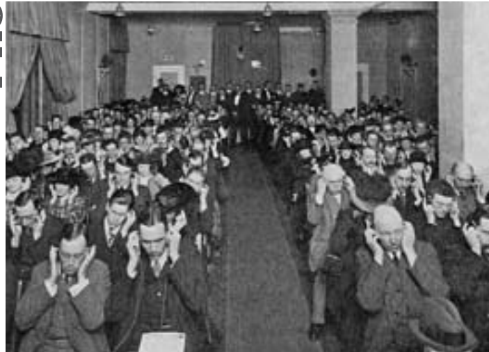
THE AUDIENCE IN THE AT&T THEATRE, PANAMA PACIFIC EXPOSITION, SAN FRANCISCO.