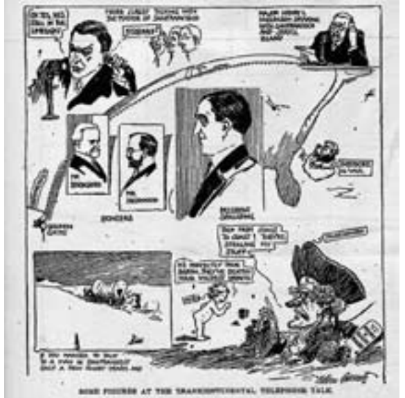
FRONT PAGE OF THE BOSTON GLOBE, JANUARY 26, 1915

TALK BY TELEPHONE FROM BOSTON TO SAN FRANCISCO World's Record Long Distance Line Works Without a Hitch.